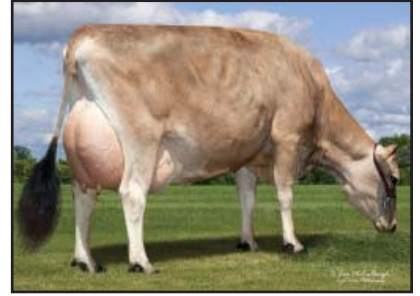
GR WAUNAKEE DALE JOY 2332{3}-ET Sister to Grandam of Lot 101C