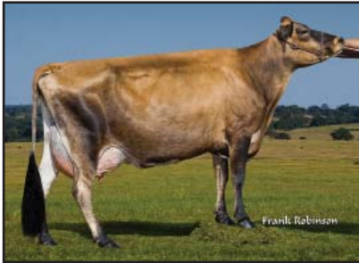
HEARTLAND IMPRESS ALLISON-ET Sister to Dam of Lot 8