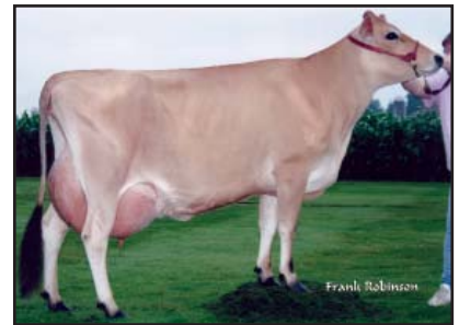
MAINSTREAM BARKLY JUBILEE Sister to Grandam of Lot 101A