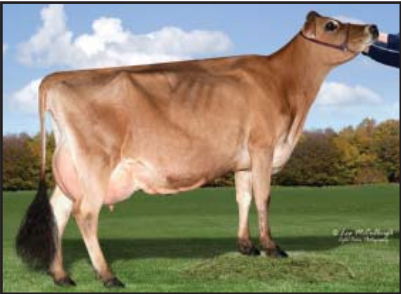
DEN-KEL JIGANTRESS-ET Sister to Grandam of Lot 2