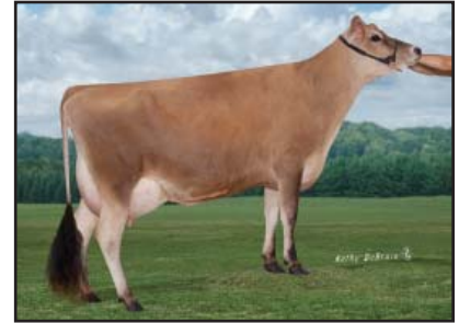
DODAN LH VISIONARY TESSA Sister to Lot 1

SUNSET CANYON MERCHANT-ET USA 114256027 GT50K JH1C JH2F 11JE884 CDCB GPTA 04/01/2016 2015DAUS 241HRDS 4%RIP 99%R 58M 0.14% 31F 21%ILE 99%R 0.04% 10P 125CM$ 111NM$ 80FM$ -20GMS 0.5PL -4.6DPR -4.9CCR -2.6HCR 3.02SCS AJCA 04/01/2016 1373DAUS GPTAT 99%R 1.6 GJUI 16.5 GJPI 98%R 31 HEARTLAND NATHAN TEXAS-ET 95% USA 067041437 GT50K JH1F JH2F DHIA HERD # 48-89-0168 CONTROL # 1437 2-10 305 3 21850 4.6 1008 3.9 843 93DCR 2785C 3-11 305 3 26340 4.3 1130 3.8 991 92DCR 3185C 5-01 305 3 25940 4.6 1185 3.7 963 94DCR 3232C 7-00 183 3 17610 4.8 844 3.5 610 79DCR 2108C 305 2X ME AVG 5L 21944M 1006F 828P 2737C PPA 1666M 23F 68P / YD 754M 11F 40P CDCB GPTA 04/01/2016 5RECS 90%R 54%ILE 111M -3F 9P 120CM$ 109NM$ 83FM$ 31GM$ 2.4PL -2.4DPR -1.4CCR -0.2HCR 2.99SCS AJCA 04/01/2016 GPTAT 85%R 1.1 GJUI 18.6 GJPI 84%R 41