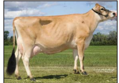
MAINSTREAM JACE J LO-ET Grandam of Lot 101A

4TH DAM: LAGERWEYS 285 SILKY 90% 9-00 365 2 37020 4.7 1736 3.6 1345 DHIR 4642C