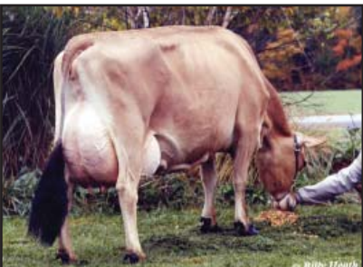
DEN-KEL LEMVIG JELLY-ET Fourth Dam of Lot 2