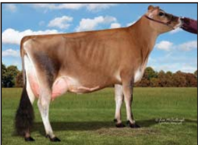
HEARTLAND TOPEKA ATHENA-ET Sister to Dam of Lot 8