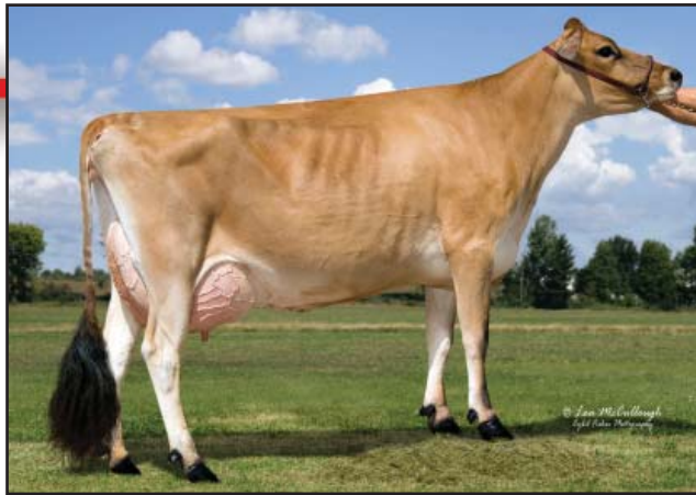
HEARTLAND ABE AVALANCHE, E-91% Grandam of Lot 8