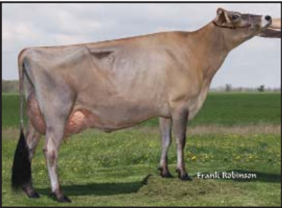
PARTEE AT BUDJON LIBERTY-ET Sister to Lot 12