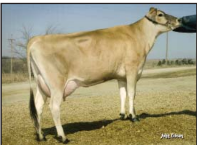
HEARTLAND ACTION AVIS Great-Grandam of Lot 8