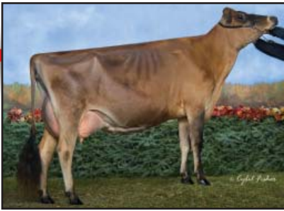
PARTEE AT BUDJON LAST CALL Sister to Lot 12