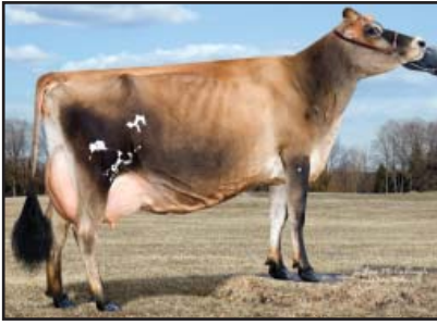
DEN-KKEL SUGARDADDY JULIETHREE Sister to Grandam of Lot 2