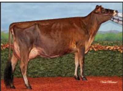
BUDJON MINISTER LIGHTEN UP-ET Sister to Lot 12