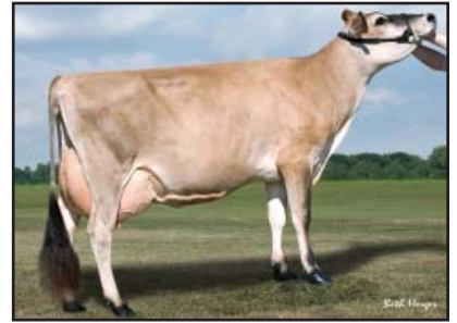
WAUNAKEE JEVON PROMISE 2058 Sister to Grandam of Lot 101C