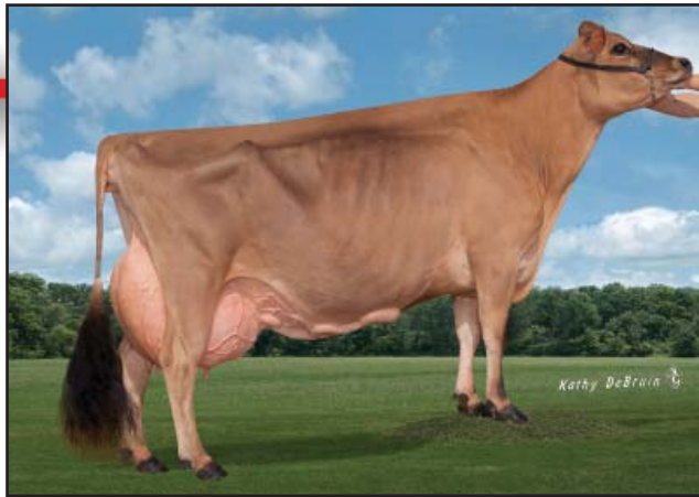
NORSE STAR SULTAN FARRAH, E-92% Grandam of Lot 10