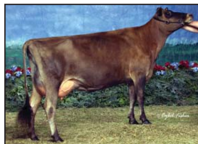
HOMERIDGE F P LISA 2 Dam of Lot 13