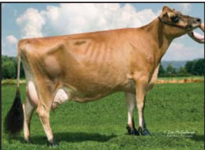
DEN-KEL IMPULS JULIE TOO Great-Grandam of Lot 2