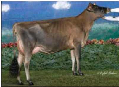
MAINSTREAM JACE J LO-ET Great-Grandam of Lot 101B