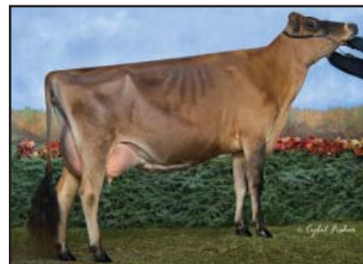
PARTEE AT BUDJON LAST CALL Sister to Lot 13