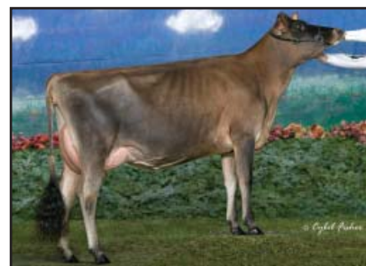
PARTEE AT BUDJON LYNDASAY-ET Sister to Lot 13