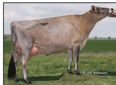
PARTEE AT BUDJON LIBERTY-ET Sister to Lot 13