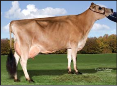
DEN-KEL JOAN-ET Sister to Grandam of Lot 2