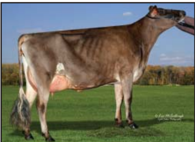
HEARTLAND SANTIAGO AINSLEY-ET Sister to Dam of Lot 8