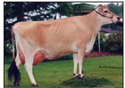
LAGERWEYS 285 SILKY Fourth Dam of Lot 101A