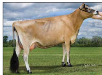
PARTEE AT BUDJON FUROR LAYLA Sister to Lot 13

4TH DAM: VAL RICHELIEU S SPOT LISA 14R VG 85 (CAN) 4-04 305 2 5820 5.9 344 4.3 251 CAN 870C