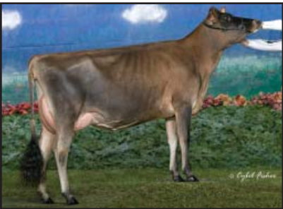
PARTEE AT BUDJON LYNSDAY-ET Sister to Lot 12