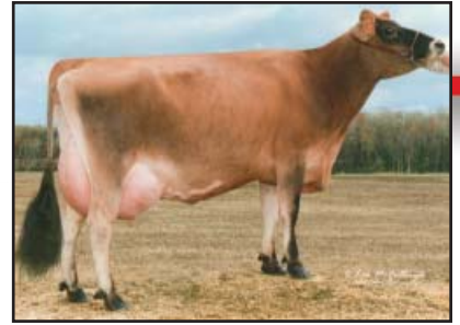
WAUNAKEE JACE PANNY-ET Sister to Grandam of Lot 101C

4TH DAM: AHLEM BSB PRINCESS 6112 93% 4-05 305 2 26850 4.9 1310 3.7 996 94DCR 3445C