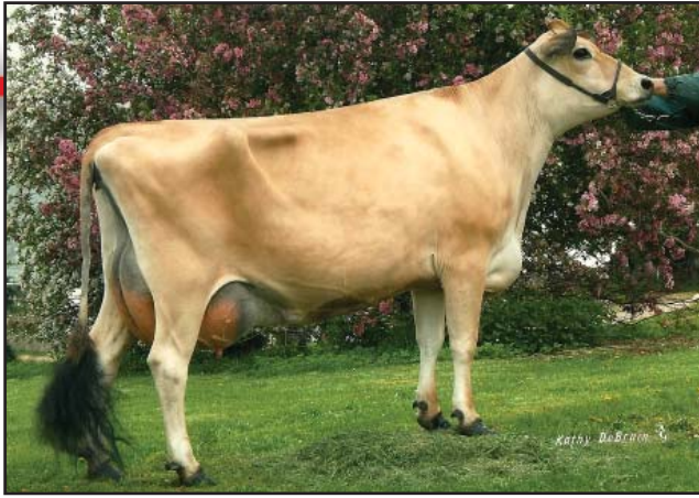
STARLINE COUNCELLER AMBITION, E-92% Grandam of Lot 3