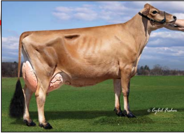
HILLVIEW LOUIE KATIPI-P, VG-89% Sister to Lot 11