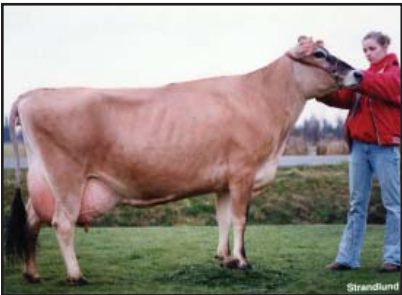
MAINSTREAM BERRETTA JOY Fourth Dam of Lot 101B