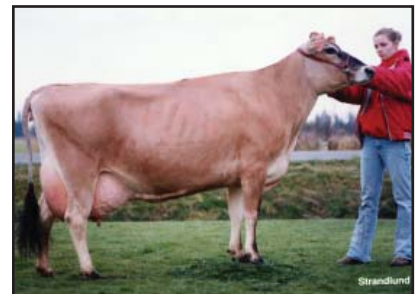
MAINSTREAM BERETTA JOY Great-Grandam of Lot 101A