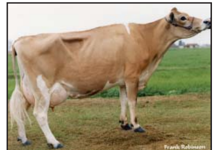
CLIFFHAVEN BROOK ALTHEA ALLY-ET Fourth Dam of Lot 1

SCHULTZ RESCUE HEADLINE USA 114114336 GT HD JH1F JH2F 29JE3510 CDCB GPTA 04/01/2016 8286DAUS 870HRDS 11%RIP 99%R 1009M -0.25% -5F 39%ILE 99%R -0.11% 14P 221CM$ 248NM$ 310FM$ 248GM$ 5.5PL 2.2DPR 1.9CCR 0.6HCR 2.94SCS AJCA 04/01/2016 4491DAUS GPTAT 99%R 0.9 GJUI 10.7 GJPI 99%R 96