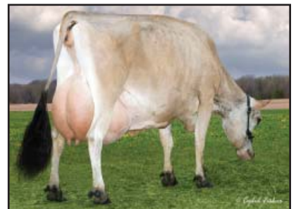
AHLEM B JOHN PRINCESS 3183-ET Great-Grandam of Lot 101C