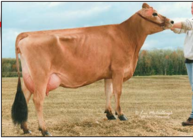
WAUNAKEE JACINTO JOY 1932, E-90% Sister to Dam of Lot 101A